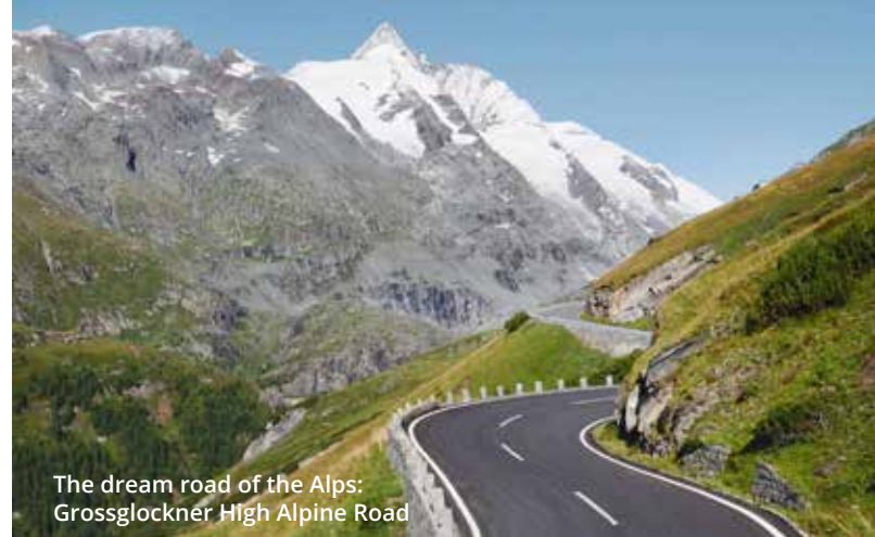
The dream road of the Alps: Grossglockner High Alpine Road

Variant Langtalseen till Elberfelderhütte: difficult Best time: July to September Duration: 12 hours (round trip ; 2-day-tour)